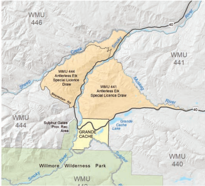
Antlerless Elk Special Licence Draw WMU 441 & 444 Map