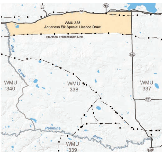
Antlerless Elk Special Licence Draw WMU 338 Map